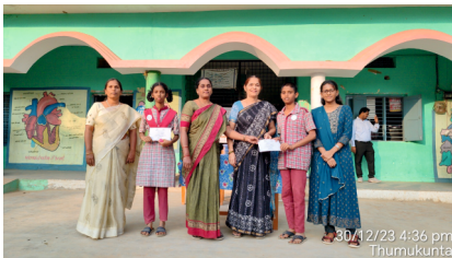
30/12/23 4:36 pm Thumukunta