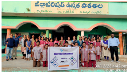
30/12/23 4:42 pm Thumukunta