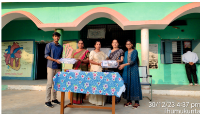
30/12/23 4:37 pm Thumukunta