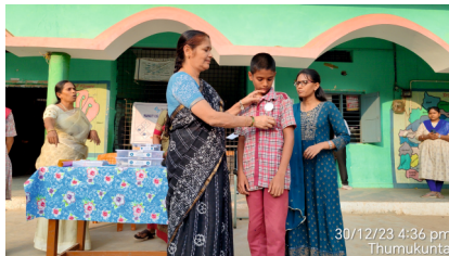
30/12/23 4:36 pm Thumukunta