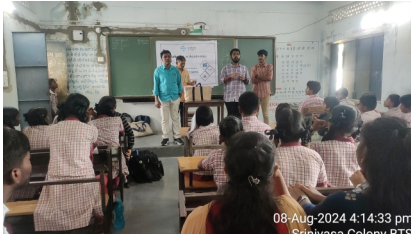
08-Aug-2024 4:14:33 pm Srijaaya Colony, B.T.S.