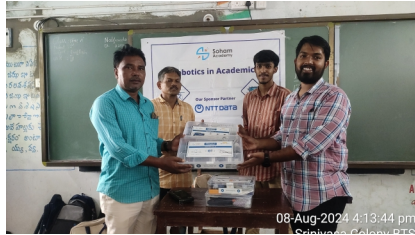
08-Aug-2024 4:13:44 pm Srijaaya Colony, B.T.S.