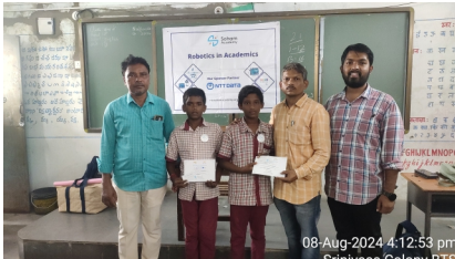
08-Aug-2024 4:12:53 pm Srijaaya Colony, B.T.S.